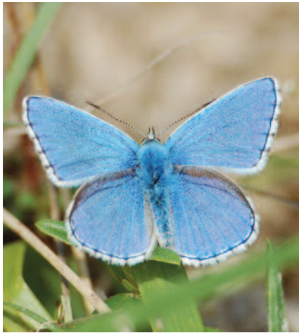
Adonis Blue Butterfly (male)

There are also a great variety of trees, plants, birds and other wildlife, including ancient beech and oak woods, rare orchids, and the famous Adonis Blue butterfly.