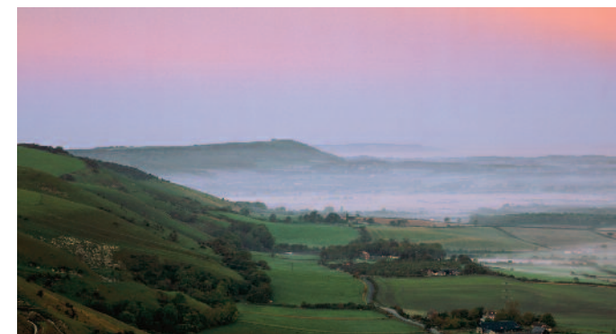
Sunrise on the South Downs near Devil's Dyke

There are cycle hire facilities in various locations including Brighton, Devil's Dyke, Hassocks, Seven Sisters, Shoreham, Titchfield (Meon Valley) and Worthing.