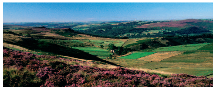
The view from Stanage Edge