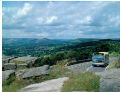
Bus 272 from Sheffield to Castleton

The South Yorkshire Peak Explorer ticket is the ideal low-cost way to discover the Peak District by bus. Buy it in advance from any Travel South Yorkshire enquiry office and other outlets in South Yorkshire and north Derbyshire. The tickets are valid for a day on buses and trams at any time within the whole of South Yorkshire and on buses in an area of the Peak District bounded by Bakewell, Buxton, Chinley and Glossop. Peak Explorer tickets cost £9 adult, £5.75 child and concessions (proof of age for over 60s required).