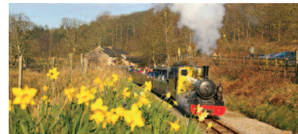
'Ratty' on the Ravenglass and Eskdale Railway

Another great way to the mountains of the Lake District is the narrow gauge steam Ravenglass & Eskdale Railway ( www.ravenglass-railway.co.uk ) which is a great way to travel up Eskdale. The railway is paralleled by a traffic free cycle trail - there is even a cycle hire at Ravenglass station and the railway can carry bikes.