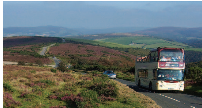
Above: Service 300 runs between Minehead and Ilfracombe Cover photo: Watersmeet, south of Lynmouth

Trains to Taunton: Off-Peak Day Return from Exeter £10, from Bristol £11, Bridgwater £5.90. Trains to Barnstaple on the Tarka Line: Off-Peak Day Return from Exeter £7.90, from Bristol (change at Exeter St David's) £25. Day Return tickets also available on other services.