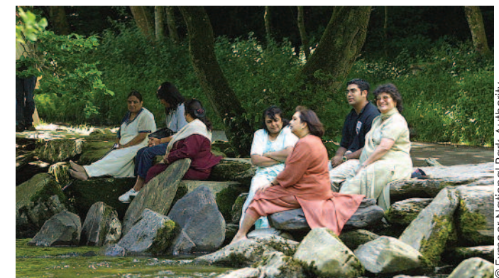
Tarr Steps Woodland National Nature Reserve

There are a number of additional daily bus services operated in the peak summer holiday season, including the special Moor Rover minibus service which will pick up walkers and visitors in any part of the National Park on a pre-arranged basis. Details from ATWEST (Accessible Transport West Somerset) Buses 01643 709701 or log on to www.exploremoor.co.uk