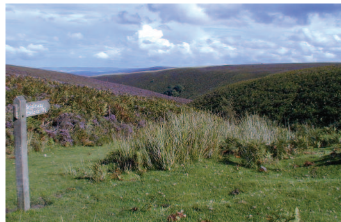
Hawkcombe near Porlock

There is so much to see and do in Exmoor National Park - and it's all just a short journey away. This is a guide to the best routes into the National Park, ideas for places to visit and the right tickets for your day out. Exmoor is well served by public transport.