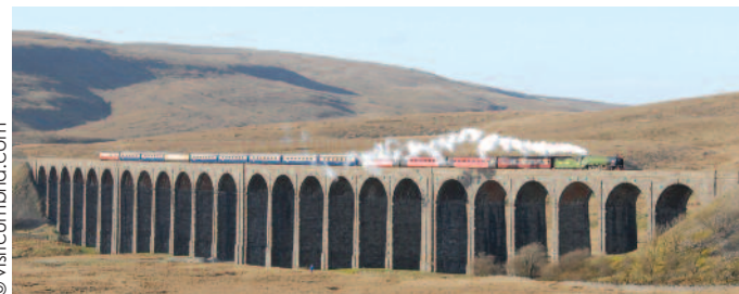
Ribblehead Viaduct on the Settle Carlisle railway line

The village of Clapham has the Ingleborough Nature Trail and Cave and Ingleton Waterfall Walks, White Scar Cave and a Youth Hostel. Both villages have paths to the summit of Ingleborough and fine walking; both are served by late morning 581 bus Mondays to Saturdays from Settle Market Place.