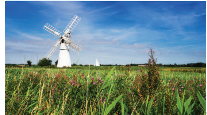
Thurne Mill, south of Potter Heigham

Of special value to visitors is the Acle Area Flexibus which meets service X1 at Acle, to take passengers (weekdays only) to villages such as Upton , South Walsham , Ranworth , Woodbastwick and Salhouse . Holders of Wherry Line tickets travel free on this bus which must be booked by 5pm on the day prior to travel.