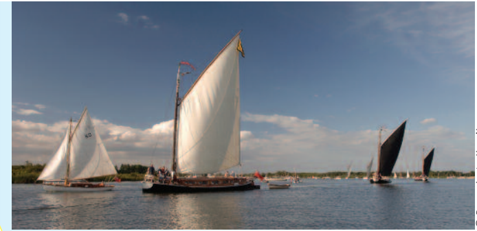
Iconic 'Wherries' and other craft on Barton Broad

For details of guided and self guided walks from stations on the Norwich - Lowestoft/Great Yarmouth and Norwich - Sheringham rail lines as well as downloadable detailed line and attraction guides, log onto www.bitternline.com and www.wherrylines.org.uk