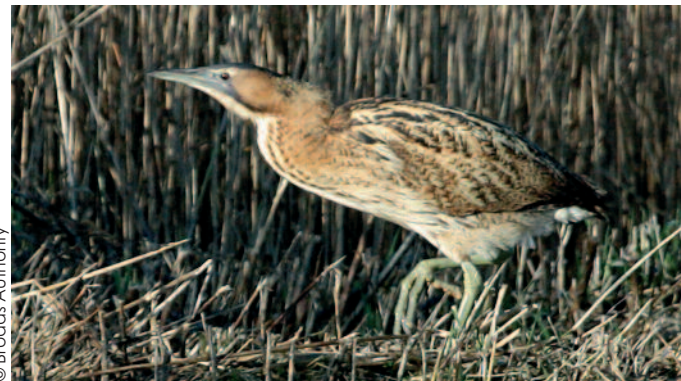
Norfolk's elusive Bittern can sometimes be seen