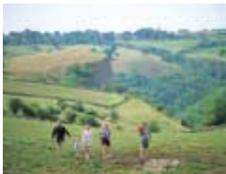
Rambles above Thor's Cave

T he Staffordshire Moorlands has some of the best landscapes in England with high moorland and spectacular gorges carved deep into the limestone rock by the Manifold and Hamps rivers. Situated in the southern part of the Peak District National Park these winding chasms are clothed in woodlands, pitted with caves and rich in heritage. The river beds are largely dry from spring to autumn, leaving a wealth of wild flowers, butterflies and birds.