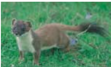
Stoat - hunter of the woods