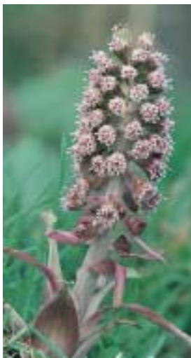
The remarkable Butterbur