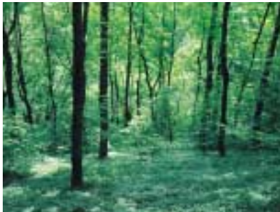
Sun dappled ash woods are home to the flycatcher

A sh woods in the area are amongst the best in Britain, rich in bird life, butterflies and many small mammals. Together with the variety of wild flowers which love the limestone soils, this diversity means that much of the Manifold and Hamps valleys and hills are designated as nature reserves and managed by Staffordshire Wildlife Trust or owned by the National Trust.