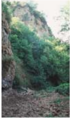
The dry bed of the Manifold at Dafar Bridge

Thousands of years ago, when the climate was much wetter, these rivers carved their way down into the easily eroded limestone, creating caves like Thor's Cave and the gorges and spectacular cliffs such as Beeston Tor. These cliffs, and the valley floor limestone outcrops, are rich in fossil remains of shellfish and corals. Fossils can commonly be seen in the stones quarried for local buildings and the field walls.