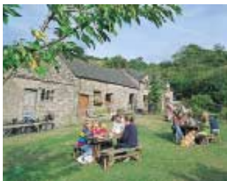
Take a break at Lee House Tea Rooms

If you love the outdoors, this is a great place to walk or cycle.