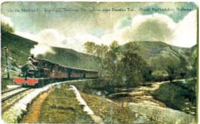
An old post card shows a train in operation.

Two eccentric steam engines, originally designed for a narrow gauge line in India, were used to haul primrose yellow coaches between the lonely halts on the line. Dubbed "A line starting nowhere and ending up at the same place", the line finally ran out of steam in 1934. When the old line was lifted the route was surfaced and turned into the Manifold Track for use by walkers and cyclists.