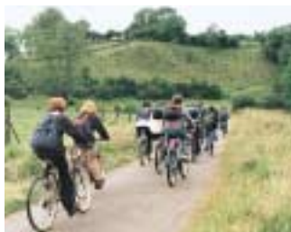
Cycling on the Manifold Track