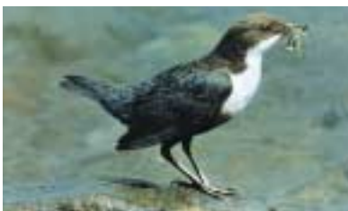
The Dipper appears to fly underwater