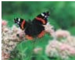
Red Admiral Butterfly

Remember these places are special - please keep to the footpaths.