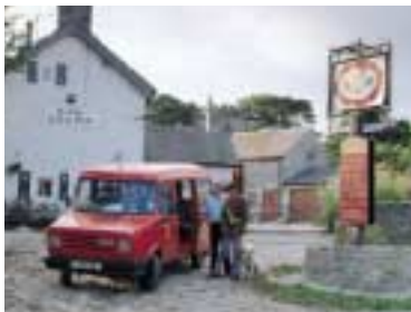
Post Bus at Wetton

For details contact Leek Tourist Information Centre or ring the Staffordshire Busline on 01785 223344.