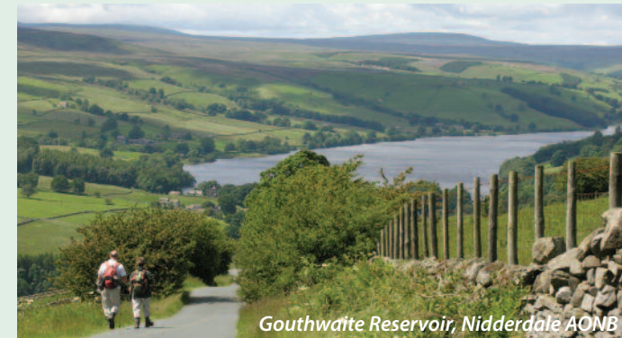
Gouthwaite Reservoir, Nidderdale AONB