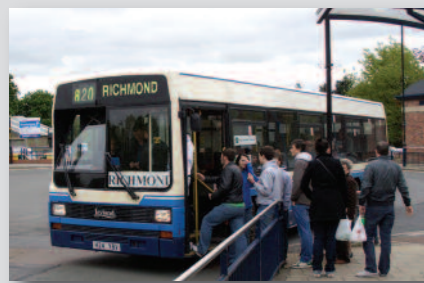
Setting off to Richmond Castle