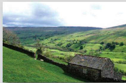
Near Rowleth in Swaledale