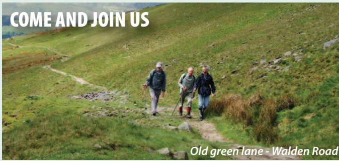
Old green lane - Walden Road

The Yorkshire Dales Public Transport Users Group , of which DalesBus Ramblers is a part, has campaigned for more than ten years to safeguard DalesBus - the greener way to enjoy the Yorkshire Dales.