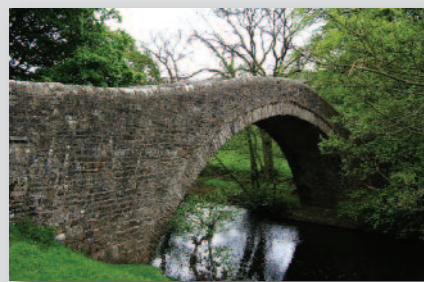
Ivet Bridge across the River Swale