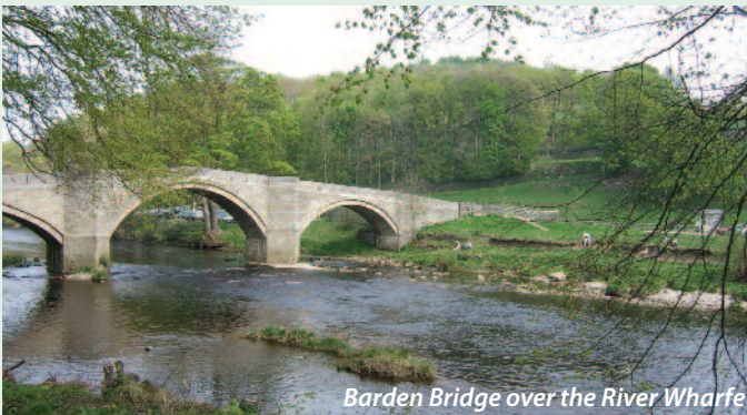
Barden Bridge over the River Wharfe

Catch DalesBus directly to Upper Nidderdale, Wharfedale, Malhamdale or Wensleydale, or take the scenic Leeds-Settle-Carlisle line with special linking buses to spectacular Swaledale or the glorious Ingleborough National Nature Reserve, with mountain walks across Yorkshire's famous Three Peaks.