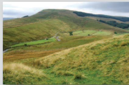
Cotter End, Cotterdale